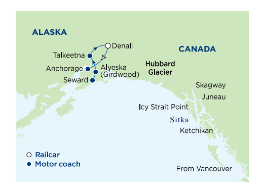
DAY 1-8 - CRUISE | 7-night sailing from Vancouver to Seward