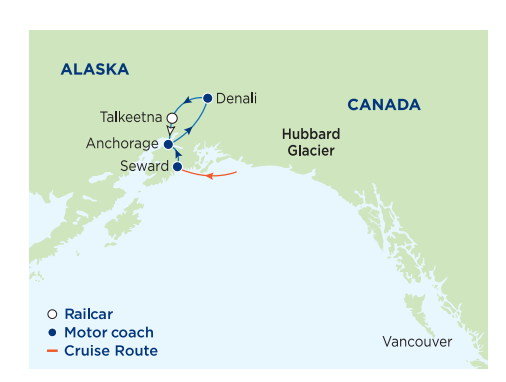
DAY 1-8 - CRUISE | 7-night sailing from Vancouver to Seward