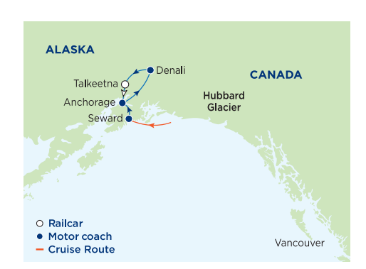
DAY 1-8 - CRUISE | 7-night sailing from Vancouver to Seward