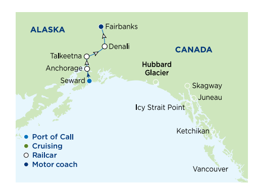
DAY 1-8 - CRUISE | 7-night sailing from Vancouver to Seward.