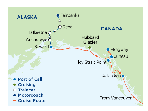
DAY 1-8 - CRUISE | 7-night sailing from Vancouver to Seward.