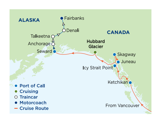
DAY 1-8 - CRUISE | 7-night sailing from Vancouver to Seward.