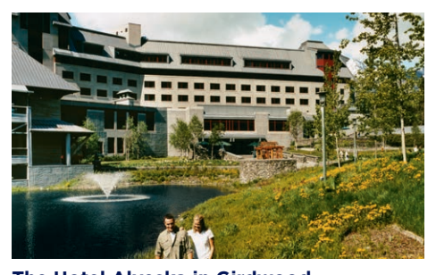
The Hotel Alyeska in Girdwood This resort destination at the base of the mountain features fine dining, shopping a saltwater pool and easy access to walking paths and nature trails.