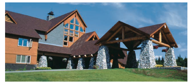
Talkeetna Alaskan Lodge

Set on a ridge just above the town, this upscale lodge offers great views of the Alaska Range. Perfect for chilly evenings, with a 46-foot fireplace in the lobby.