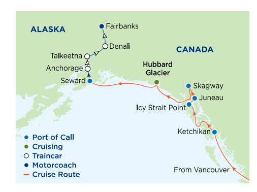
DAY 1-8 - CRUISE | 7-night sailing from Vancouver to Seward.